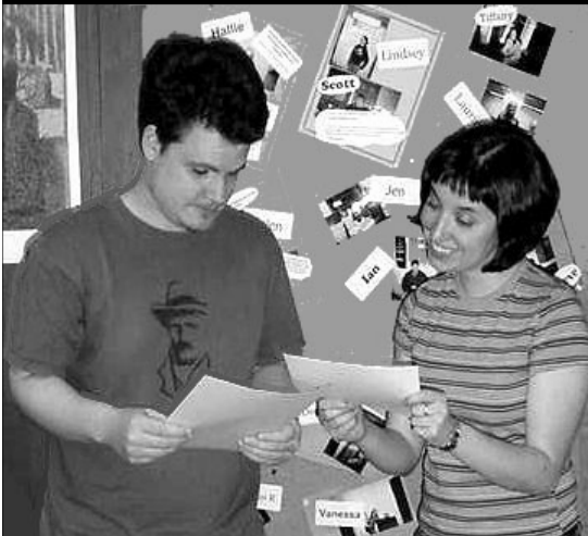
So that's how you cite Websites!