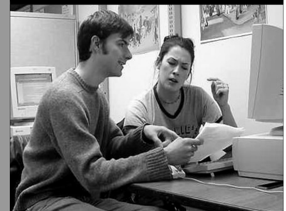
So should I move this whole section?